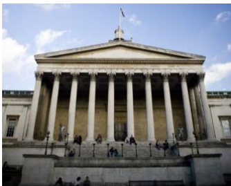
UCL, University College London, England, UK