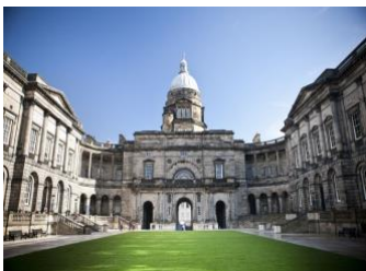
The University of Edinburgh, Scotland, UK