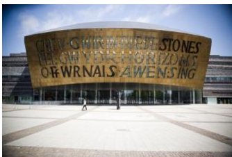
Wales Millennium Centre, Cardiff, Wales, UK