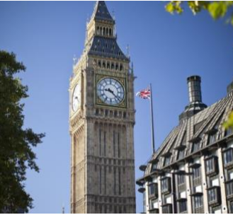
Big Ben. London, England, UK

The UK is also the eighth-largest manufacturing economy. In November 2023, the Business and Trade Secretary launched the UK's Advanced Manufacturing Plan backed by £4.5bn in the Autumn Statement on finance. Over £2bn has been allocated to the automotive industry, including batteries, and £975m for aerospace.