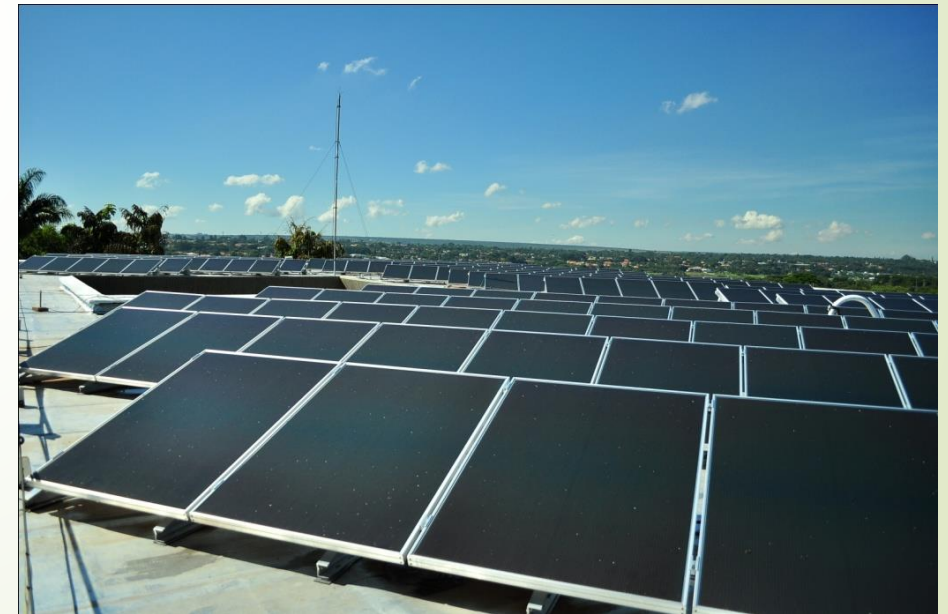
Photovoltaic system of Italian Embassy