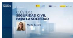
Horizon Europe: Cluster 3 - Civil Security for Society