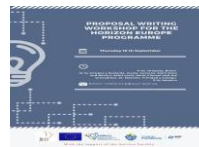
Writing Camps for Horizon Europe