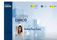
Horizon Europe: Cluster 4 - Digital, Industry and Space