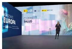
Horizon Europe: Clúster 1 - Health