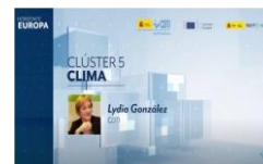
Horizon Europe: Cluster 5 - Climate, Energy and Mobility