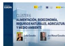
Horizon Europe: Cluster 6 - Food, Bioeconomy, Natural Resources and Environment