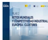
Horizon Europe: Cluster 2 - Culture, Creativity and Society