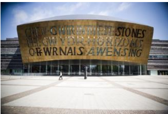
Wales Millennium Centre, Cardiff, Wales, UK