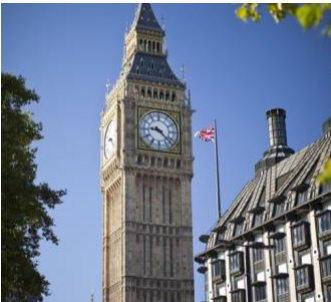
Big Ben, London, England, UK

There are many different ways to obtain funding for your research in the UK, including specialised councils operating in the UK that offer grants and fellowships.