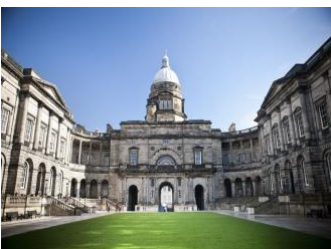
The University of Edinburgh, Scotland, UK