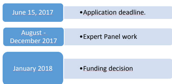
Figure 1. Estimated time frames for the grant year 2018.