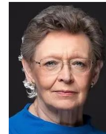
Françoise Barré- Sinoussi