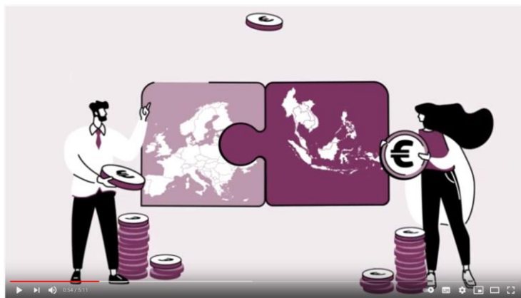
JFS application tutorial video