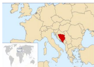
Bosnia and Herzegovina