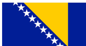
Flag of Bosnia and Herzegovina.

For the last edition of EURAXESS North America newsletter in 2021, we revisit a story about Bosnia and Herzegovina, a land steeped in heritage, natural beauty, and a healthy dose of innovation fit for the 21 st century.