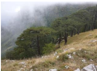
Sutjeska National Park