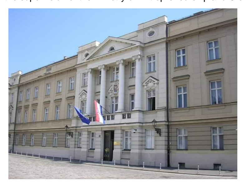
EURAXESS Countries in Profile: Croatia / 2019

HAMAG-BICRO is the Croatian Agency for SMEs, Innovation and Investments established by the Government of the Republic of Croatia with the purpose of enhancing SME development and promoting investment and innovation. The Agency is an independent institution under the supervision of the Ministry of Entrepreneurship and Crafts.